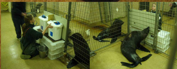
The picture on the left show the experimental set-up with the two containers in which the different odors were kept and the picture on the right show a seal making a choice.