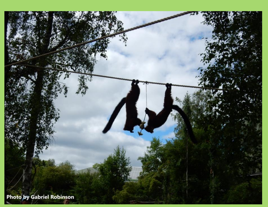
Red ruffed lemurs interacting with the food enrichment