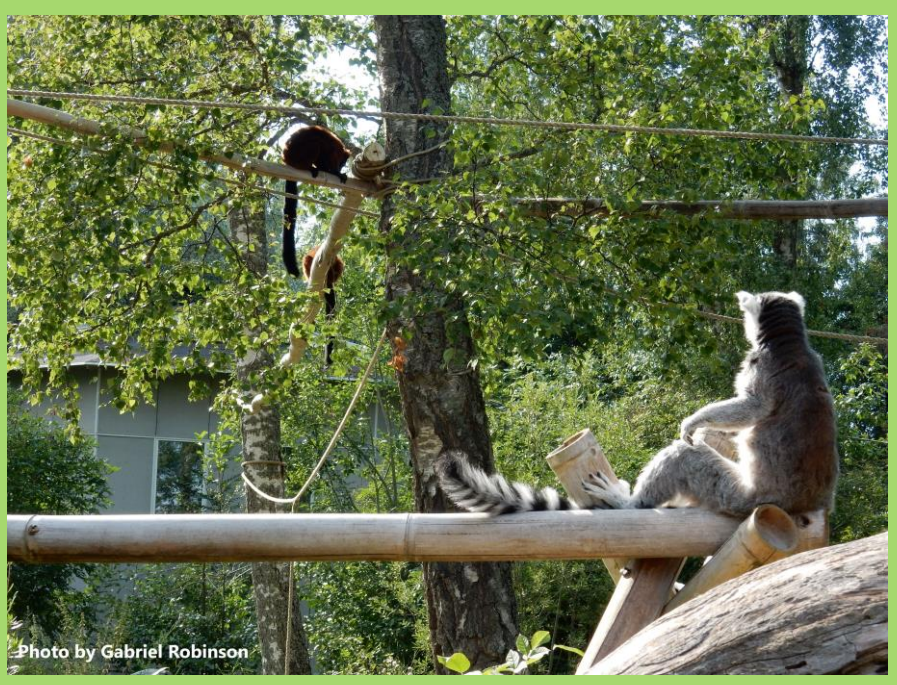
Both species interacting with the structural enrichment