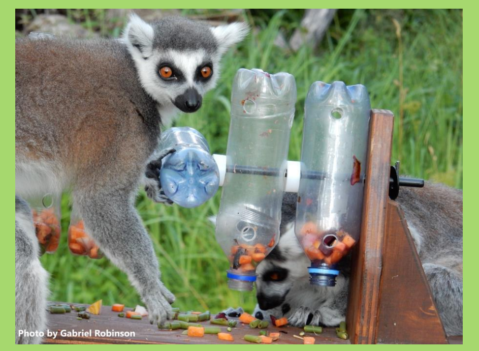
Ring-tailed lemurs interacting with the food enrichment

Five-minute interval scan sampling was used to record lemur location and behavior, as well as the weather conditions and the presence of zoo visitors in the enclosure over a month. That baseline was followed by four alternating two-week periods of food or structural enrichment, both with and without visitors.